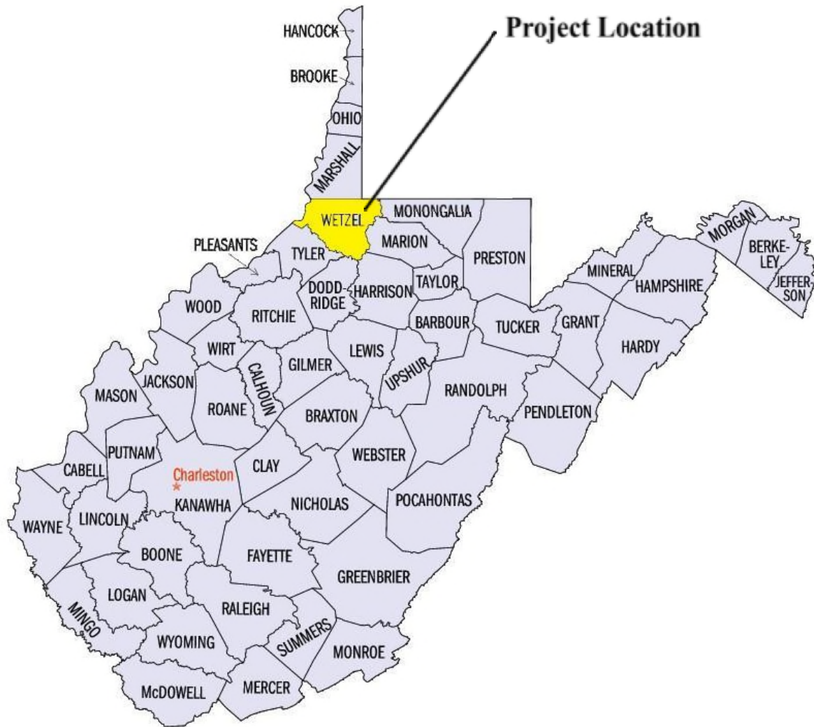
Exhibit 1 Project Location Map